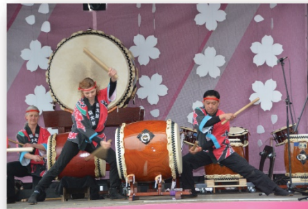
Taiko Drummers at the 2019 ANA Stage at the Tidal Basin

3. Now you are ready to play your drum and create your own beat!